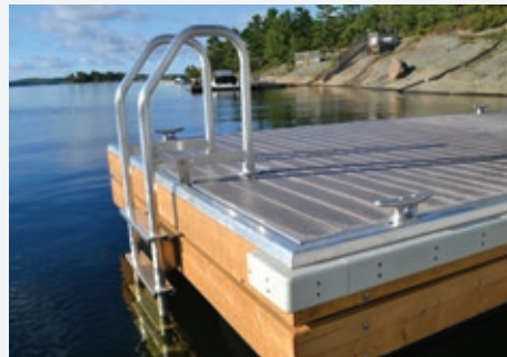
Aluminum Swim Ladder