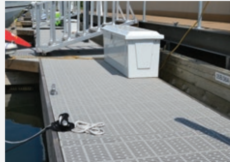
ThruFlow non-skid decking