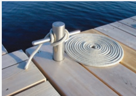
Stainless steel mooring bollards