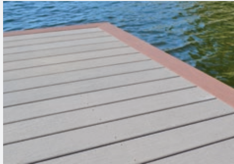
Moistureshield composite decking