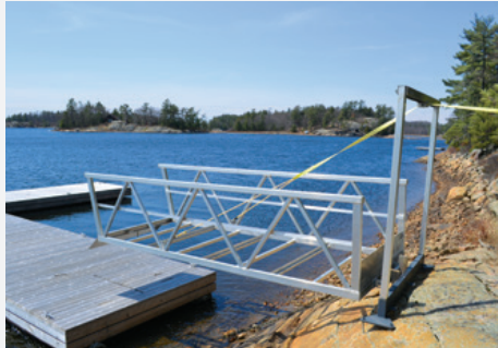
Removable ramp winch system