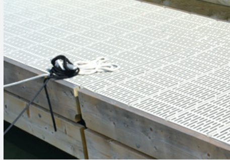
ThruFlow non-skid decking