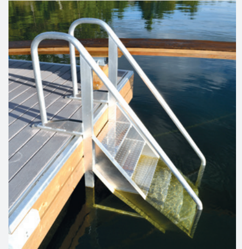
Aluminum Swim Stairs