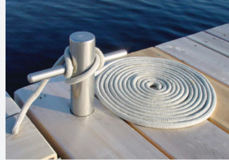
Stainless steel mooring bollards