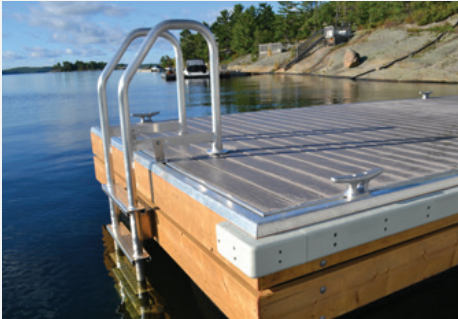
Alluminum Swim Ladder