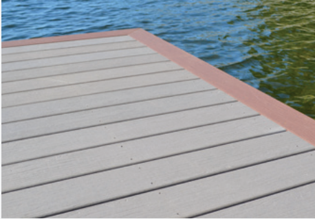
Moistureshield composite decking